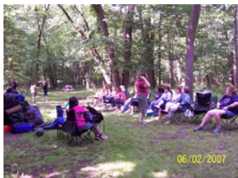
Mom Meeting at mother/son campout

At the Oakbrook Terrace employee parking lot. Members save big on slightly used or lightly damaged items. Items are marked down 40% to 80%. You need to be a member to buy, but don't worry if you are not, you can sign up to become an REI member that day for a one time fee of $15. Call 630-574-7700 with questions.