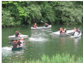
Fun on the water after the races!

THANK YOU! To all our scouts - we had a great time and can hardly wait for the 3rd annual mother/son campout next year!