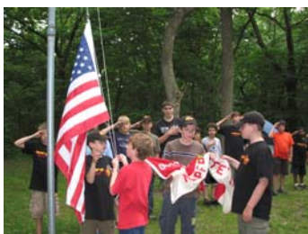
Closing Flag Ceremony at Mother/Son

On September 8th we will be attending the NIU football game and campout. This event will be open to all of our Scouts and their families. We will be registering for this event as a Troop, please watch for a permission slip/sign up sheet to come home soon!