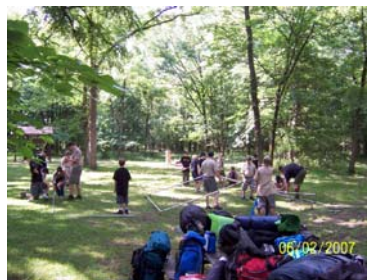
Setting up camp at mother/son 2007

Any time we travel to and from a Troop campout, the Scouts of Troop 75 are required to wear their Class A shirt, Troop 75 hat, and a neckerchief or bolo (First Class and above may wear a bolo). It is to the scout's discretion as to what type of pants and socks he wears on a campout. Please keep weather conditions in mind and be appropriately prepared.