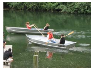
Mother/Son race photo finish!