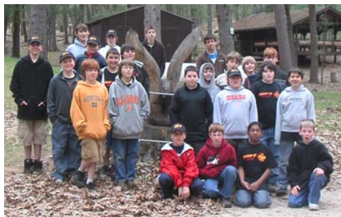
The Scouts tour Camp Blackhawk (GO!)

Wow! Beautiful weather, many fish caught, and excellent food cooked outside, what more could you ask for at a Troop Campout? Everyone who attended the May camping trip to the Camp Wolverine (ZAXIE!) on the Owasippe Scout Reservation had a great time. We fished, canoed, went out in row boats, played football, sang songs and performed skits around the campfire, and took a tour of Camp Blackhawk (GO!) where we saw our summer camp site, checked out the mess hall and experienced "the jumps".