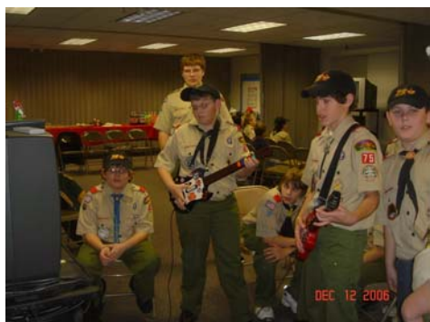
Some friendly competition!