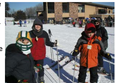
2007 Ski Trip to Cascade Mountain

Have some extra space in your garage or shed? There are some Troop properties in need of temporary homes: the Klondike Sledge, the bridge logs and ropes and a few other odds and ends. You don't have to store all the items, just what you have room for. Please let Gary or Ana know if you can spare the Troop some space!