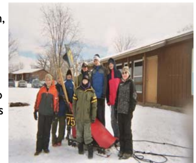
Troop 75 Takes 2nd Place at Klondike