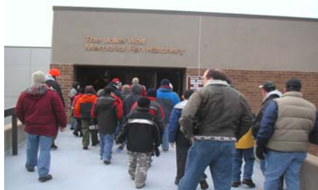
Despite the cold weather, everyone enjoyed the fish hatchery campout in March.

Because the 204 School District does not have school on May 4th, we are planning to leave the church at 1:00 pm, please plan your day accordingly.