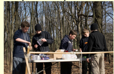
Scouts work together at Loons Basic Training, April 20.

Lake campout. We found out that a snowstorm had hit Devils Lake, and it covered the hiking trails with two feet of snow. We were disappointed, but thanks to the quick actions of the scoutmasters, we were able to alter our trip from Devil's Lake to the marvelous Starved Rock. This allowed the scouts to hike and enjoy the great outdoors. The next day the whole troop went on a 5-mile hike and everyone enjoyed it. The Philmont crew learned how to use the jet boilers and bear bags. We had a fantastic time on our unexpected campout.